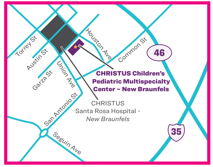
☐ CHRISTUS Children's Outpatient Rehabilitation - New Braunfels

598 North Union Avenue, Suite 230 New Braunfels, Texas 78130